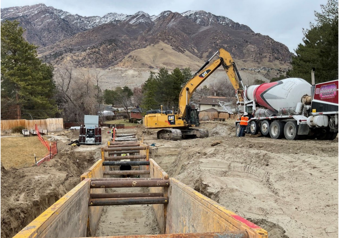
Feb 2: The Little Cottonwood Conduit is being relocated for the new SLAR alignment.