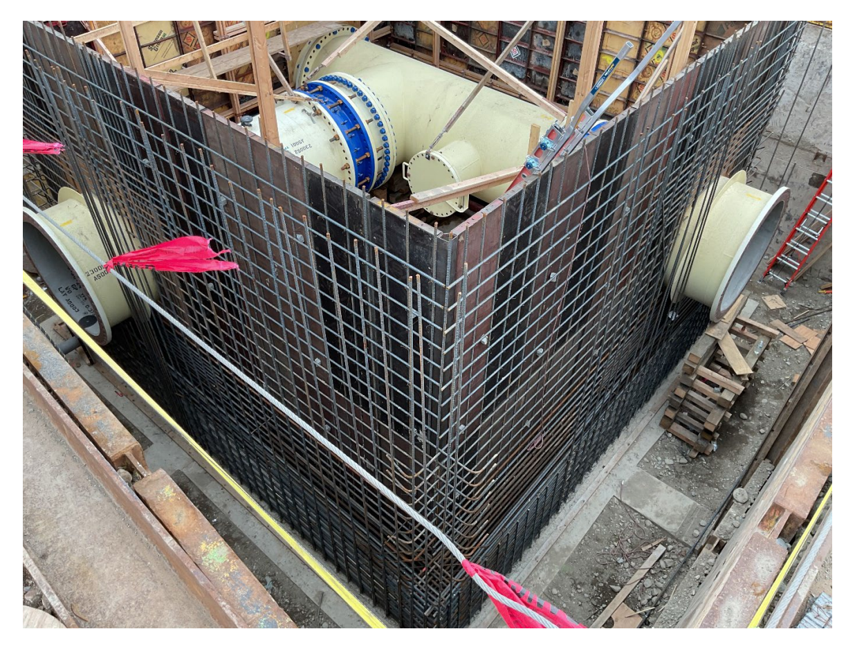
Feb 2: Rebar and forms for CC-1 vault walls is installed.

<u>Easement Acquisition</u>: Occupancy is in place for all but eight properties. Staff is actively engaged with all of these.