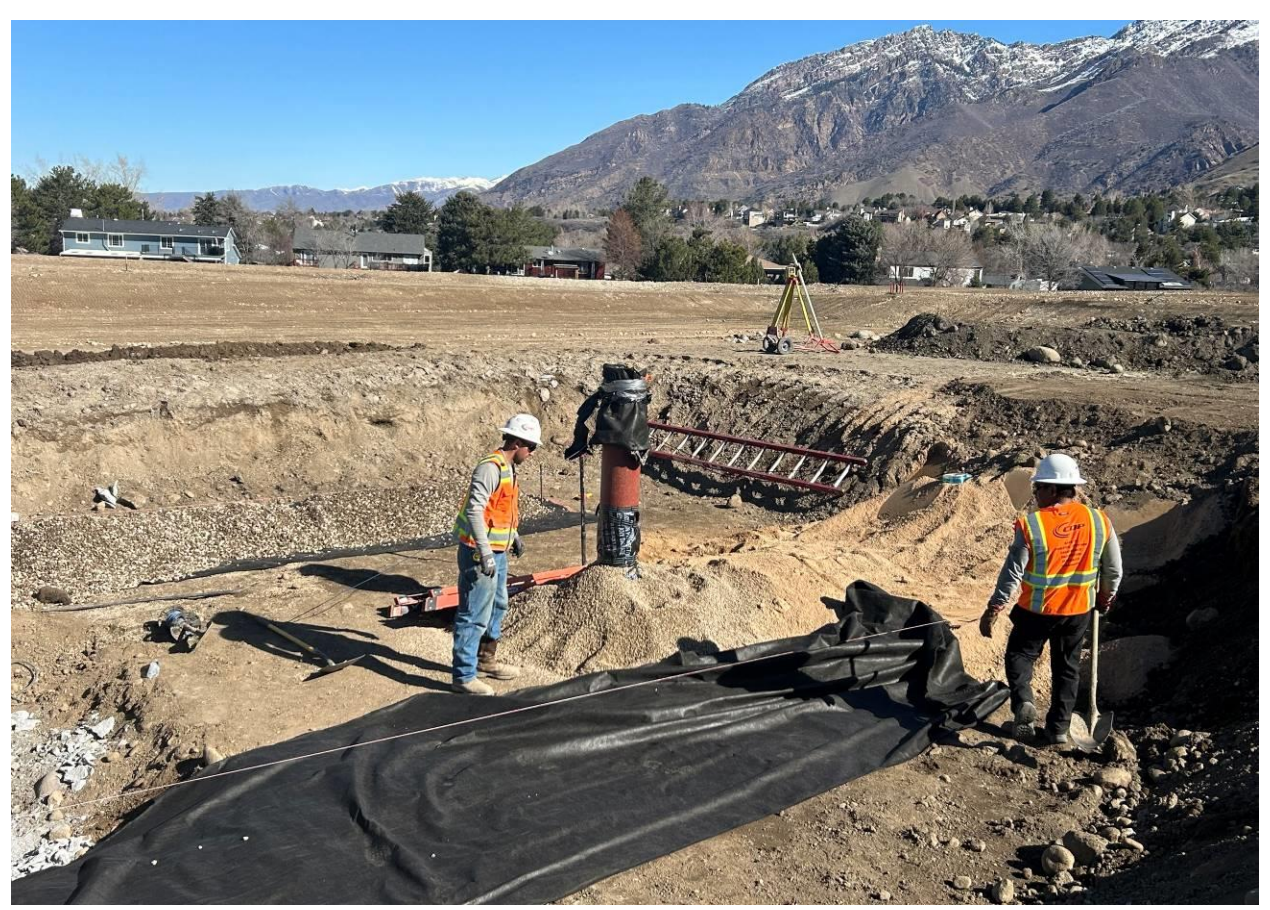
March 18, 2024: The contractor excavated to prepare for the well house.