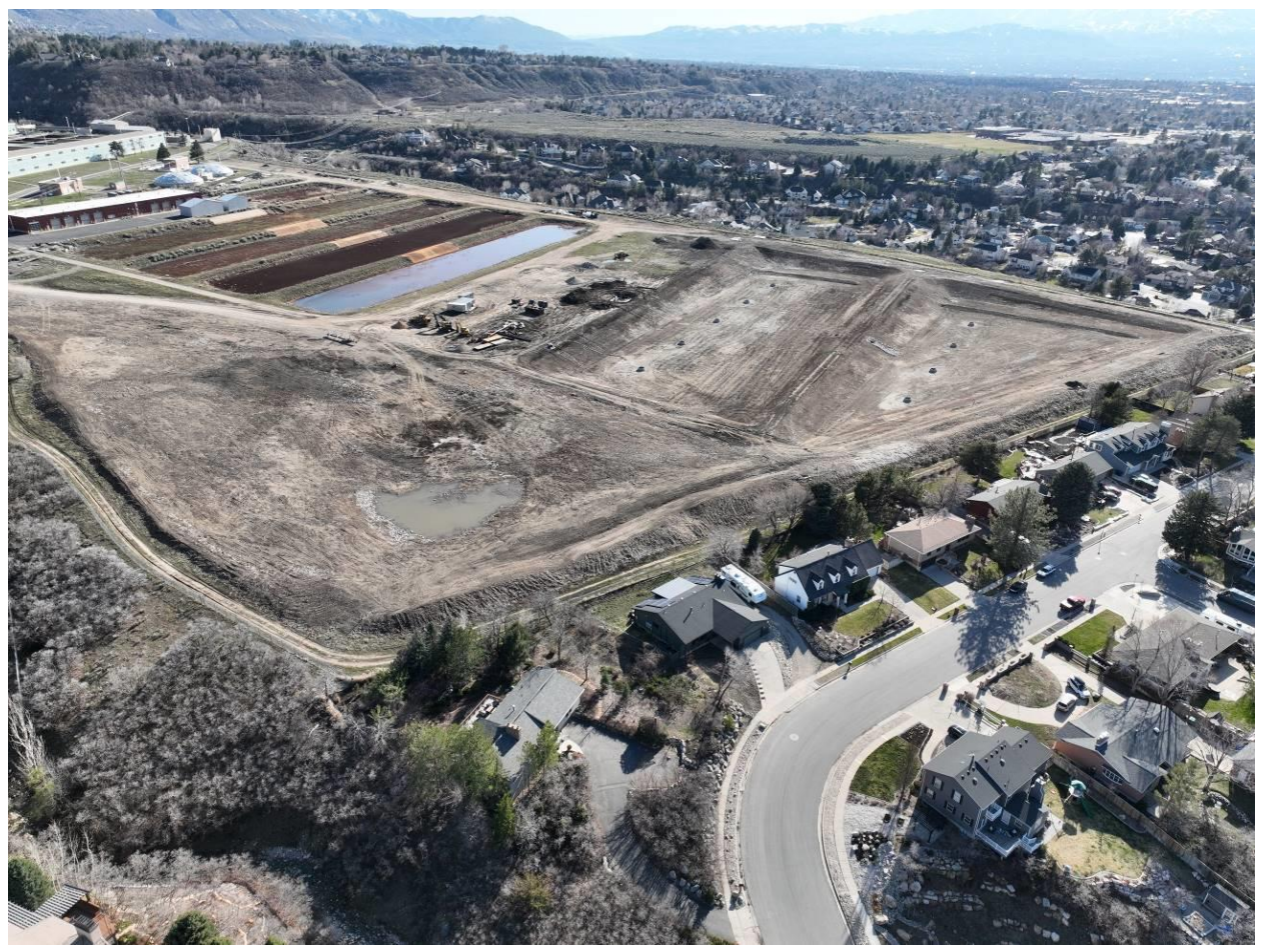
March 18, 2024: Overall site progress.

Staff looks forward to reporting to the Board in more detail in May regarding the project purpose, progress, and future.