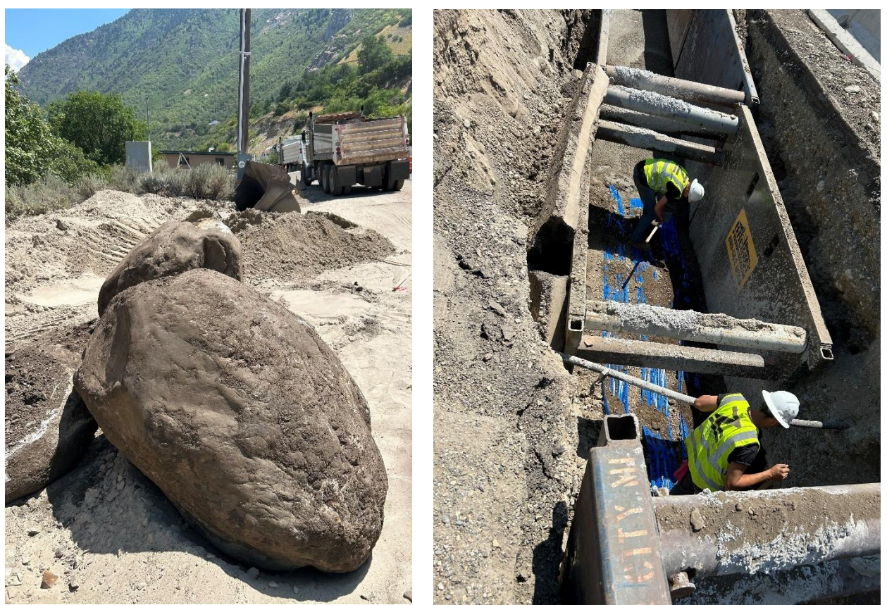
Left: The contractor is routinely removing large boulders in the excavation. Right: Blue warning tape is installed above the pipe after backfill.