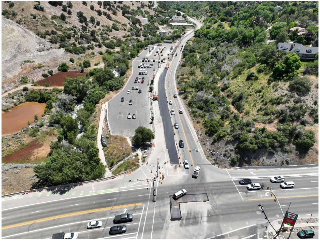
June 20: Progress on CC-1 east.