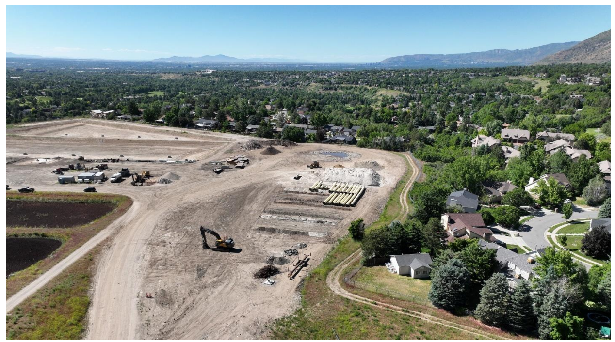
June 20: The contractors are juggling staging at the LCWTP.

<u>Public Involvement</u>: Public meetings were held in Cottonwood Heights on July 15, 17, 23, and 25. A project press conference / ground breaking is scheduled on August 6. Staff is very pleased with the level of effort and professionalism Kimley Horn brings to the project.