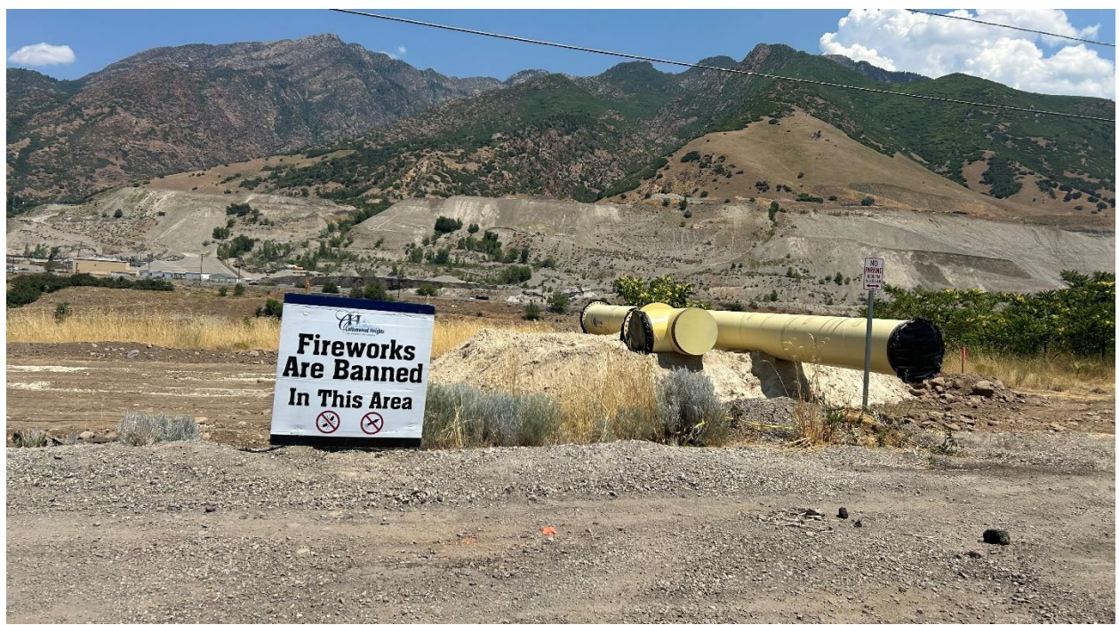
July 17: Grubbing, potholing, and pipe staging is beginning at Fort Union Blvd and Nutree Dr.